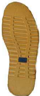
Jumbo Rib $2.00/pair

Natural: Size 8 = 12 1/4 ", 10 = 12 1/2 ", 12 = 12 3/4 ", 14 = 13 3/4 " Brown: Size 14 = 13 1/2 " Black: Size 10 = 13 1/8 "