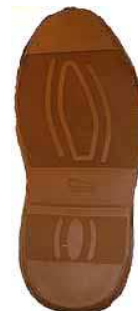
Maple Crepe Uncut Size 16 = 16 3/4 " $1.00/pair

Color : Black Size 8 only Open Stock $1.25/pr