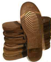
Oil Proof Full Sole JW#7084

Size 8 = 11 1/2 ", "9 = 12", 11 = 13", 12 = 13 1/4 ", 14 = 14 1/4 ", 15 = 15"