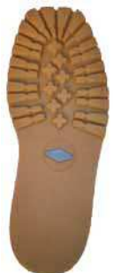
GY Lug Full Sole Oak $2.00/pair

Size 8 = 11 1/2 ", "9 = 12", 11 = 13", 12 = 13 1/4 ", 14 = 14 1/4 ", 15 = 15"